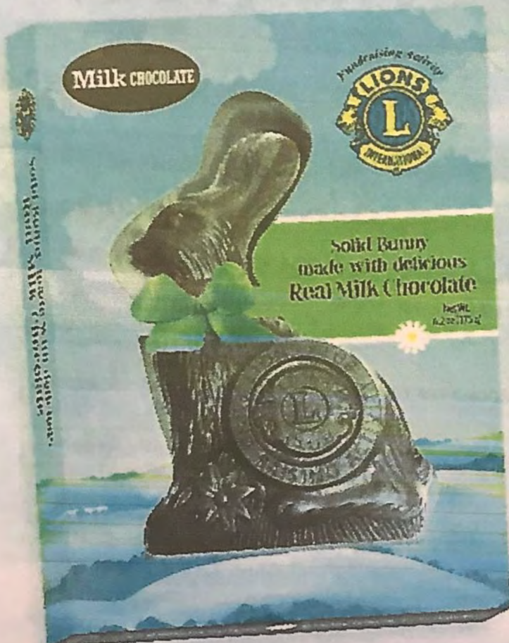
175 g Milk Chocolate

Contact any Miamisburg Lions Club Member $6.00