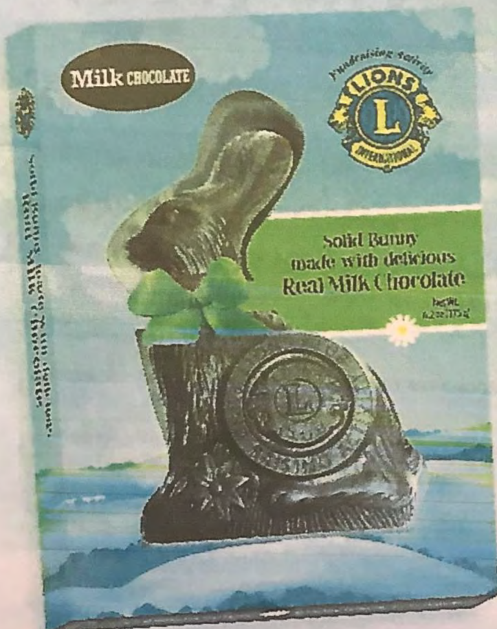
175 g Milk Chocolate

Contact any Miamisburg Lions Club Member $6.00