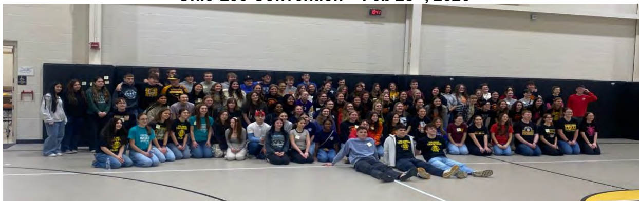
Ohio Leo Convention – Feb 28 th , 2026