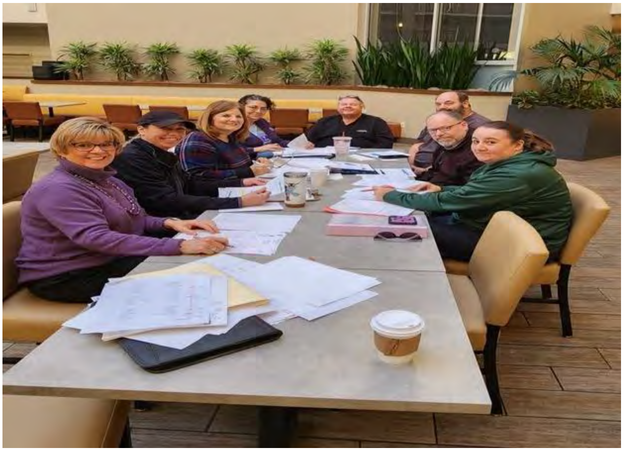
2025 District Convention Committee Planning