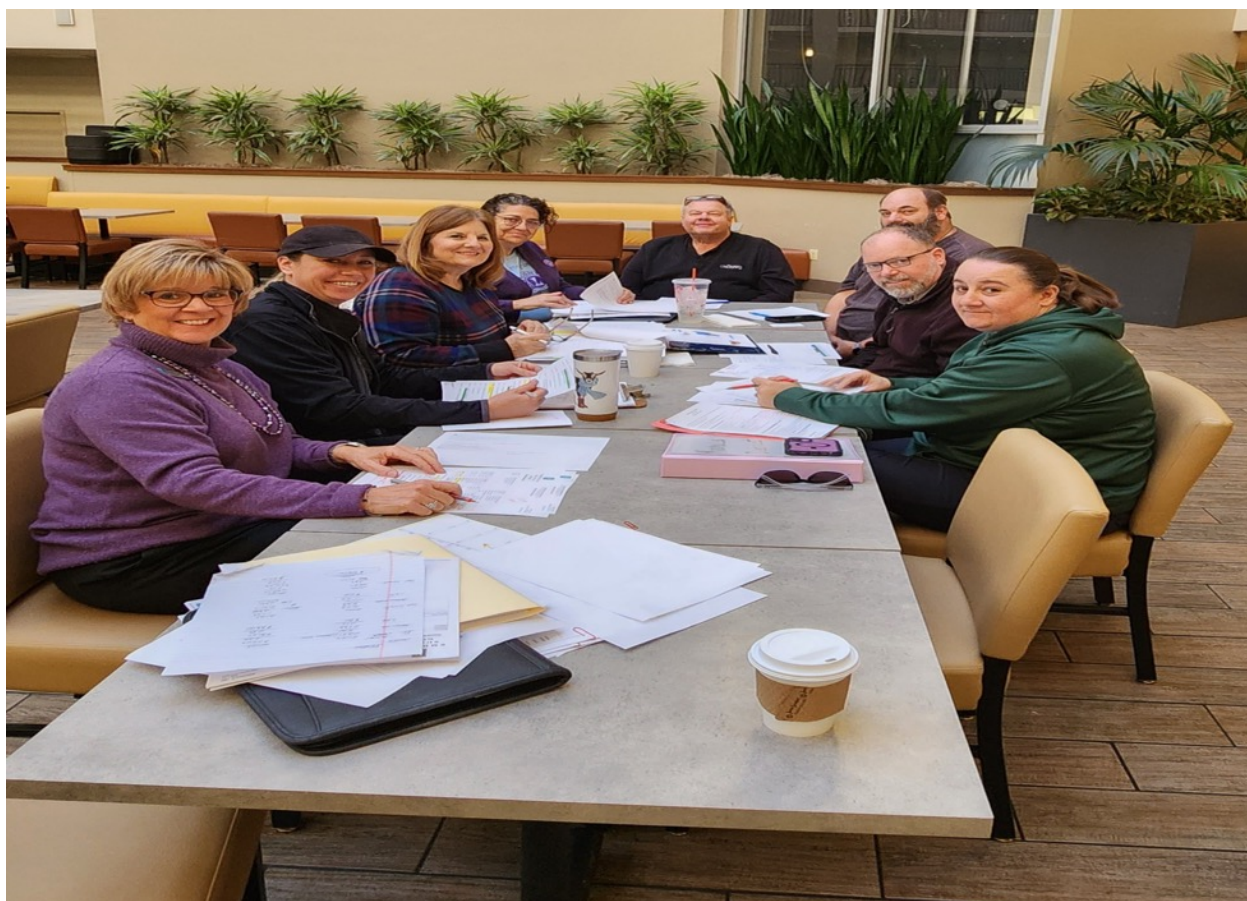
2025 District Convention Committee Planning