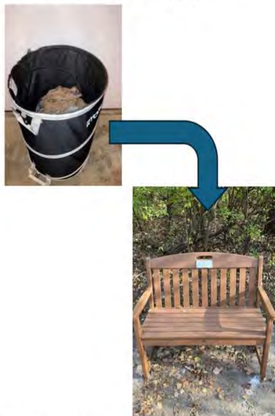
Lion Pat Niskode', 9/4/2024

Which single-use plastics are recyclable?