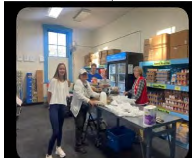
Picture of some members of Lebanon's Lions and Leo club helping out at the Lebanon Food Pantry for "Fall into Service"

Collecting plastic for bench and collecting eyeglasses. Working at the local food pantry for Fall into Service and passing out free books at Bowman Primary School.