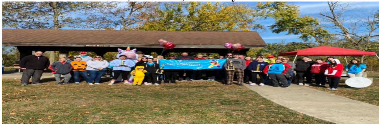
2024 OH6 STEPS at Eastwood Metro Park on 10/27