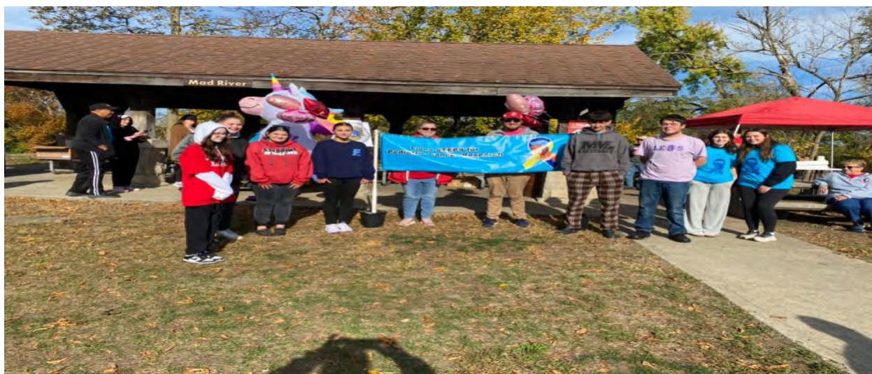
Leos from Fairborn, Stebbins, and Waynesville at OH6 STEPS