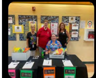
Picture of Lebanon Lions Club passing out free books that we purchased for kids at Bowman primary school.