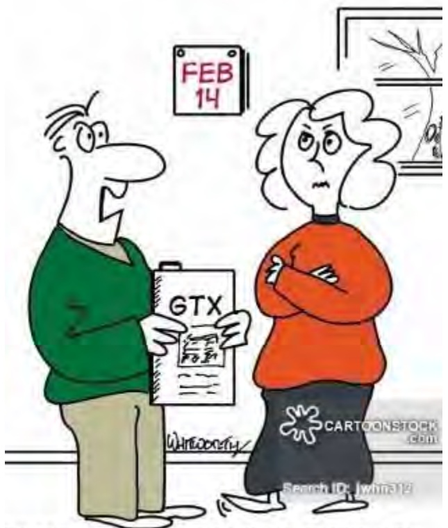
"YOU DIDN'T LIKE IT WHEN I GOT YOU FLOWERS FROM THE PETROL STATION, SO THIS YEAR I'VE BOUGHT YOU A LITRE OF ENGINE OIL."