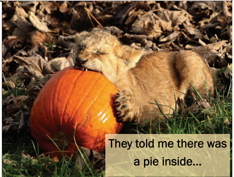
They told me there was a pie inside...