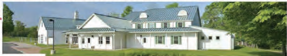
Charity A. Krueger Farm Discovery Center Aullwood Audubon Farm, 9101 Frederick Pike, Dayton, OH 45414