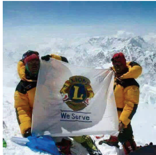
The Lions flag at the top of the world! Flying on top of Mount Everest.

Please consider writing an article or providing hints.