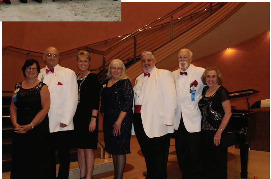
Right: Ohio District governors looking their finest