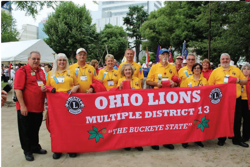
Above: Ohio District Governors in the parade